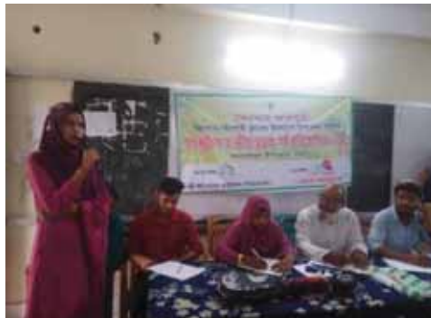
A participant, contestant in a patriotic song contest

With intellect and mind, a beautiful future. Based on this slogan Under the management of Coast Foundation and with the cooperation of Pallikarma-