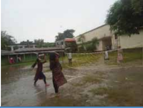
Girls team badminton competition

organized through 90 youth and 90 youth clubs in their 90 unions. I hope that through this club, if good