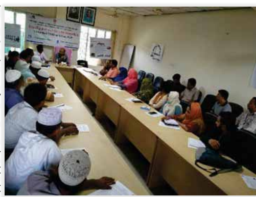
On the day a coordination meeting was conparents, community and ducted in CiC office.

The celebration was curtained with a coordination meeting at Camp In-charge office with the participation of president and members of community education support group, Majhi, Imam, parents and different organizations personnel. They got important on celebrating the as it created a chance to get the