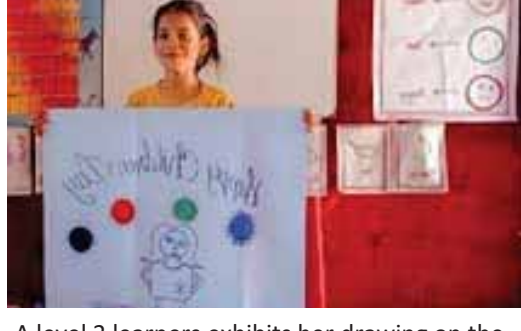
of community education A level 2 learners exhibits her drawing on the support group, Majhi, day of World children Day.

gram staff along with a drawing exhibition of Myanmar culture and rural picturesque.