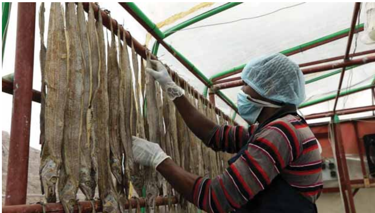
Dry fish processing using organic and toxic chemical free method at Rashid Mia Bridge, Moheshkhali, Cox's Bazar

Project Name : “Improving Local Capacity in Producing Organic Products and Managing Seed Fund of the Entrepreneurs” in Moheshkhali, Cox's Bazar Evaluation Duration : 21 st December to 26 th December 2019