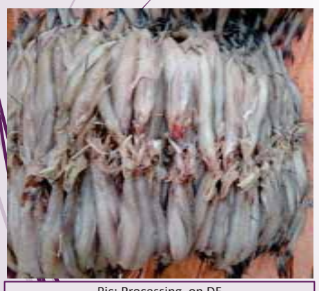
Pic: Processing on DF