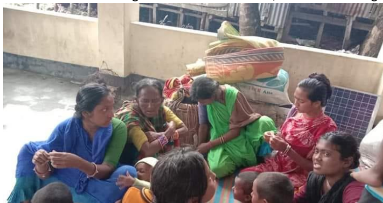
Date: 10/11/19; Women and children gathered in a cyclone shelter at Char Hardinge Union under Lalmohon Upazila

In total 13 people were killed in Khulna, Bagerhat, Satkhira, Barishal, Madaripur, Barguna, Pirojpur, Shariatpur, Bhola and Patuakhali. Among all the coastal districts, Satkhira and Bagerhat were in the most vulnerable positions. Around