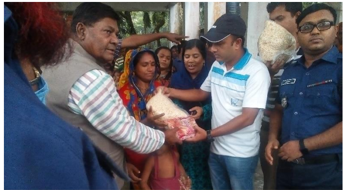
COAST was distributing relief in Lalmohon Upazila with the presence of Upazila Chairman, Upazila Nirbahi Officer and SP circle

It is mentionable here that the government took several initiatives to respond the cyclone. A total of 17,36,174 people were evacuated from their homes and taken to 5,551 cyclone shelters in 14 coastal districts. And army, navy deployed for emergency response especially for the highly affected regions. Furthermore in all the coastal districts control rooms were opened on behalf of the government different departments for any type of emergency response.