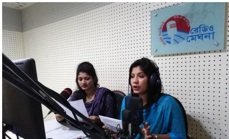
Radio Meghna was broadcasting the Weather Bulletin received from BMD