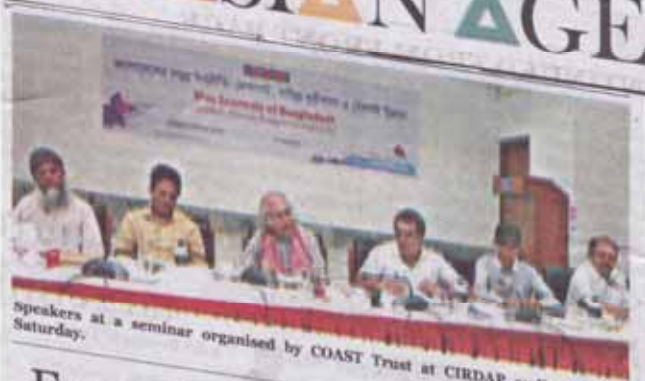
Speakers at a seminar organised by COAST Trust at CIRDAP auditorium on Saturday.