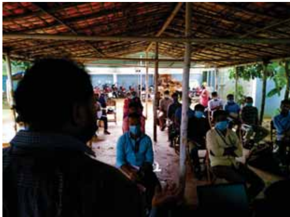
PM discussing about recent circular. PC:Minar(M&E)

COAST education program planted more than one thousand seedlings in one year ago under the self-funding of staff. Various species of seedlings were planted. After one year around 70% of seedlings are demolished due to Heavy rain, Children and community people's unconsciousness. Different species of trees were planted besides Cucoko LC in Camp-14. We found only a Nim tree touched the roof of LC.