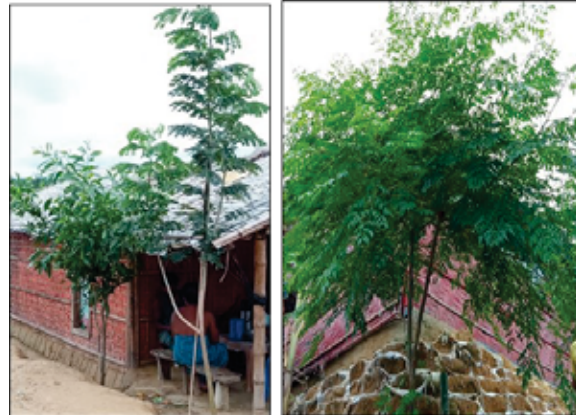
Two picture taken from Camp 14&15.

Monthly BLI teachers meetings were conducted at 8 Camp on 19 July. All BLI attended the meeting on there working camp. TO and PO conducted the training.