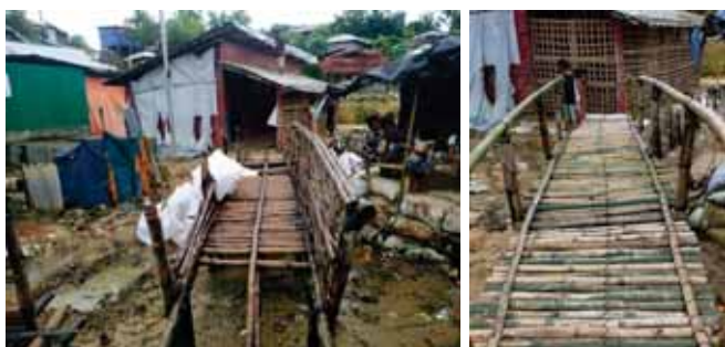
It's a part of LC repair work of Rose LC in Camp-2.