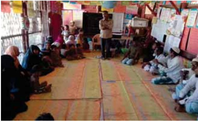
A part of Parents meeting