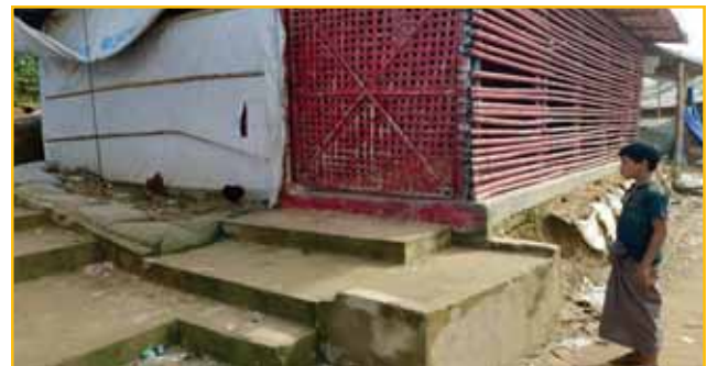
After construction stairs and drain